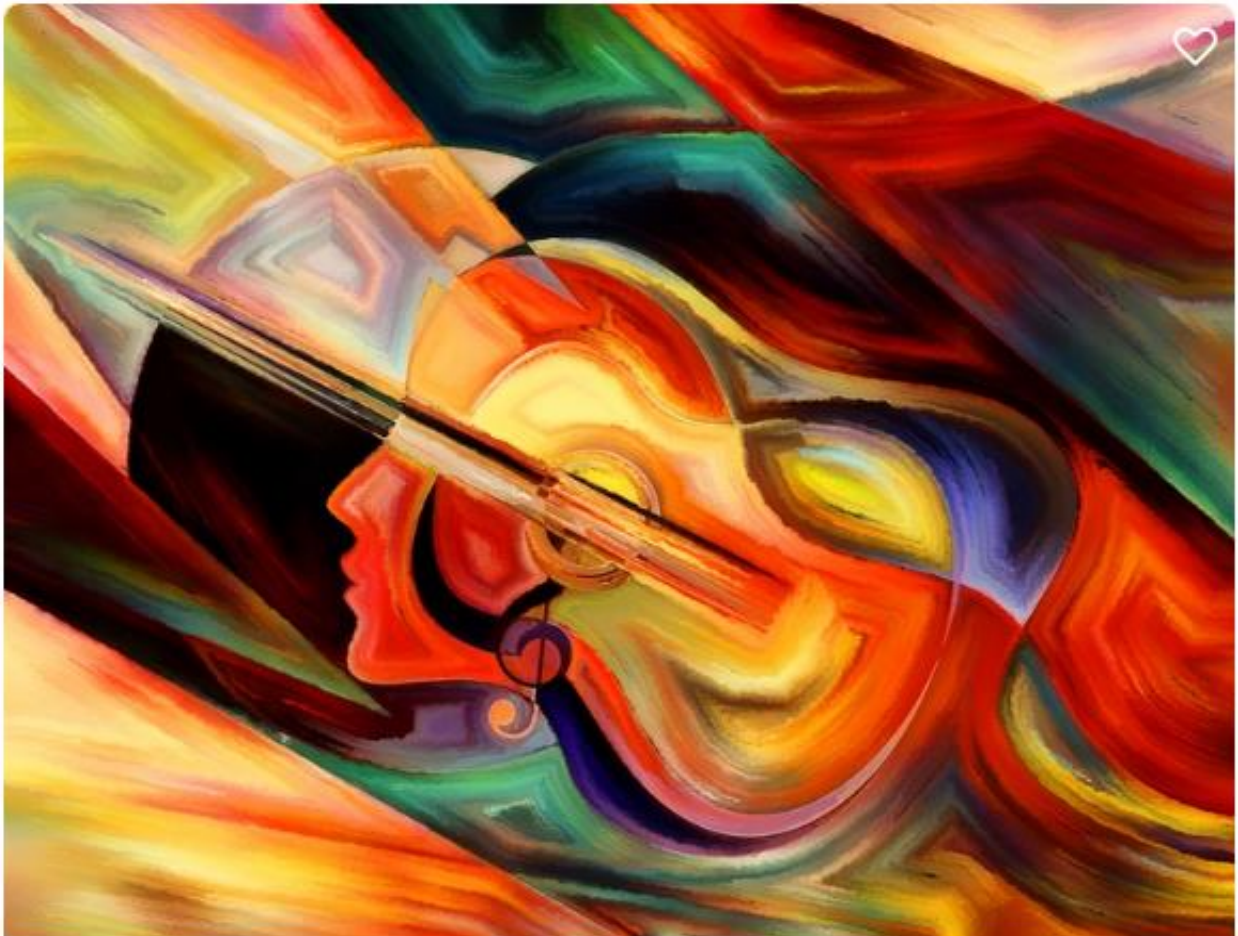
Performing Arts